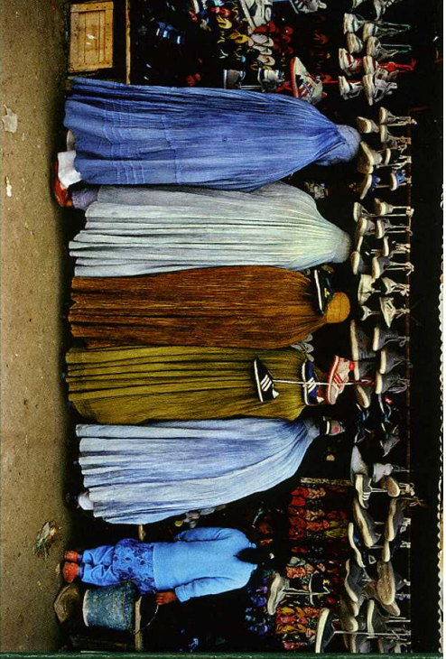
Kabul, Afghanistan, 1992